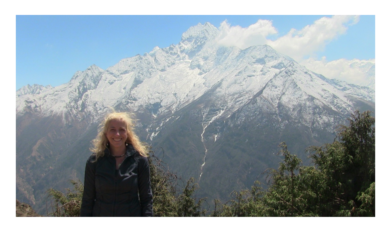
Hiking the Everest Base Camp Trail

Hi! Thank you for your interest in my ghostwriting services. I am looking forward to working together to write your book. I take your story from creation to publication. Here are a few questions clients have about ghostwriting and my process. Let me know if I can answer any other questions you have. I'm here to make this easy, fun and inspirational for you. Like climbing a mountain, the process is easy and enjoyable when you take it one step at a time! Please give me a call at 831-521-8933 to schedule your discovery call or email me at elliwrite (at) yahoo (dot) com.